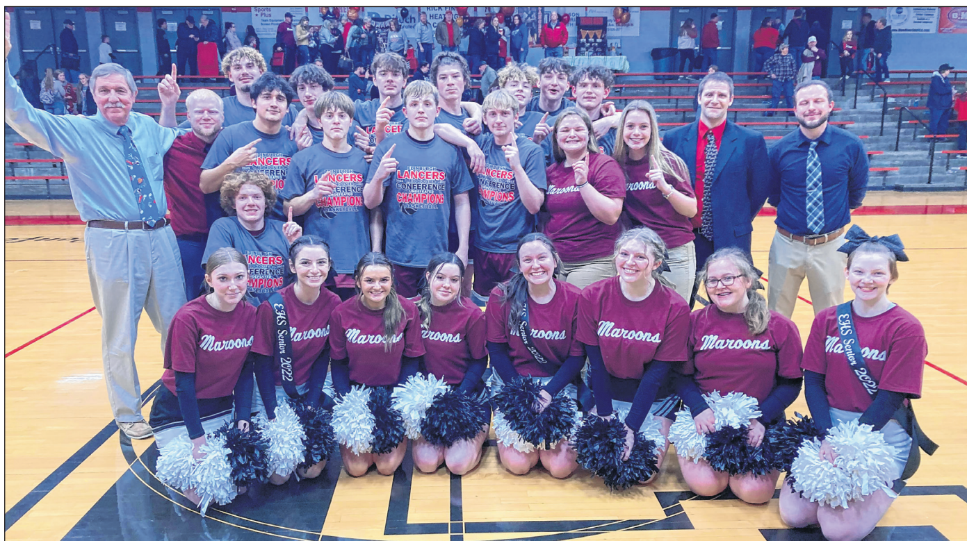
The varsity boys basketball team, coaches and cheerleaders celebrate after winning the Mid-Hoosier Conference championship Friday night. The boys won 100-73 over South Decatur, the first time a Lancers team hit 100 points since 2011.

All rights reserved. No portion of this publication may be reproduced in any form without permission from the publisher, except as permitted by U.S. copyright law.