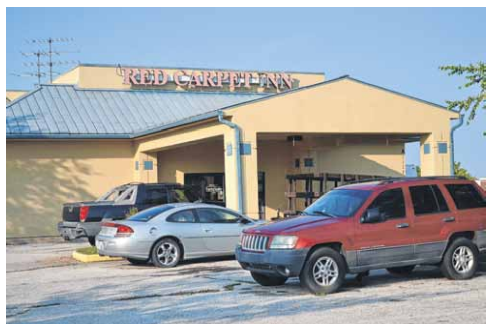
DAILY JOURNAL FILE PHOTOS

With July's shooting at the Greenwood Park Mall in the back of people's minds, people have expressed concerned about safety and security at events and festivals across Johnson County. Local police said they do not see any additional threats and believe that events across the county will continue to be safe.