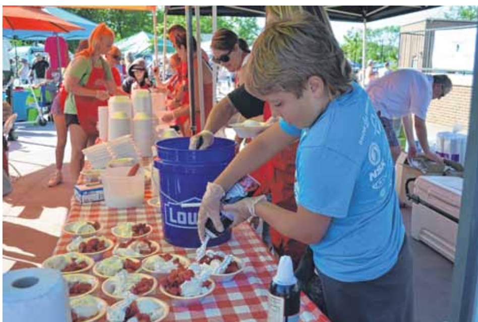
From top: A young volunteer puts whipped cream on a strawberry shortcake during Strawberries on the Square. // Edinburgh residents and out-of-towners gathered to celebrate the town's 200-year history during the Bicentennial Birthday Bash in June.

County officials were weighing the idea of using federal relief money to give all county employees a one-time stipend for inflationary relief. The proposal would allocate $1.7