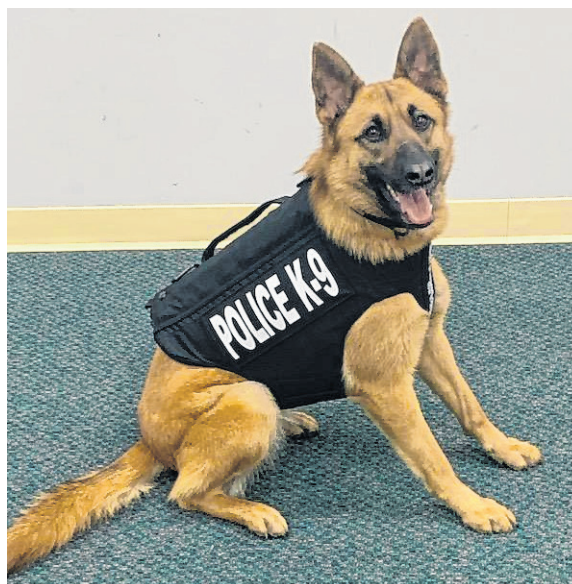
Edinburgh Police Dept. K-9s Skye, above, and Kira, left, are shown wearing their protective vests. The vests, which provide protection from bullet and stab wounds, were donated by Vested Interest in K-9s, a non-profit organization.